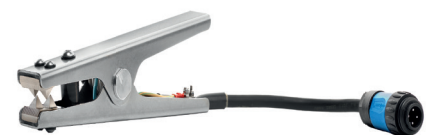
SG/B-CMS1-SCM, clamp with M connector