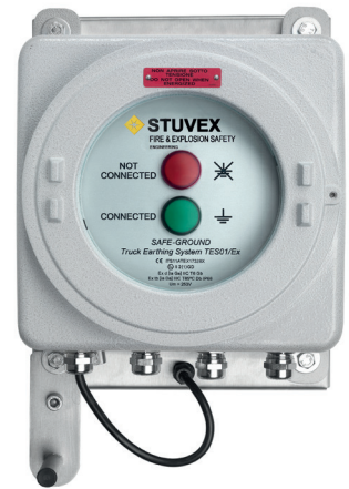
SG/E-TES01-V2/EX with clamp hook and cable glands

The TES01-V2 EX is suitable for use in ATEX/IECEx zones 1,2, 21 and 22.