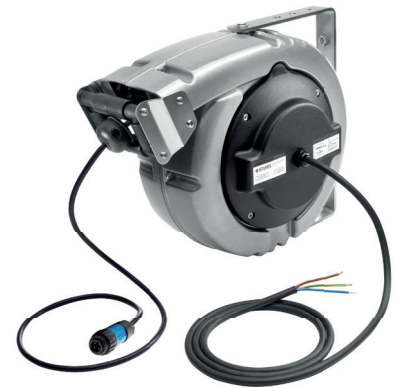
SG/E-CR1/65-15SCF with F connector

With active clamps, the two clamp jaws are insulated from each other and from the clamp body itself. As long as the clamp jaw is not connected to a conductor, the circuit between the clamp jaws will stay open and no current can flow. Connecting the clamp to the truck's earthing point will close the circuit. The TES01-V2 becomes operational. An optional storage point for the clamp can be supplied, with or without a shelter.