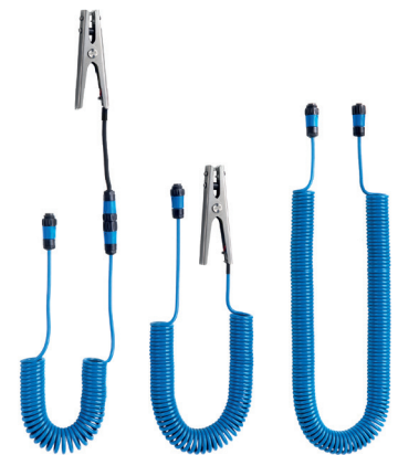
SG/B-SP1-HD with clamp and connector